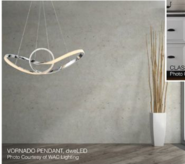
VORNADO PENDANT, dweLED