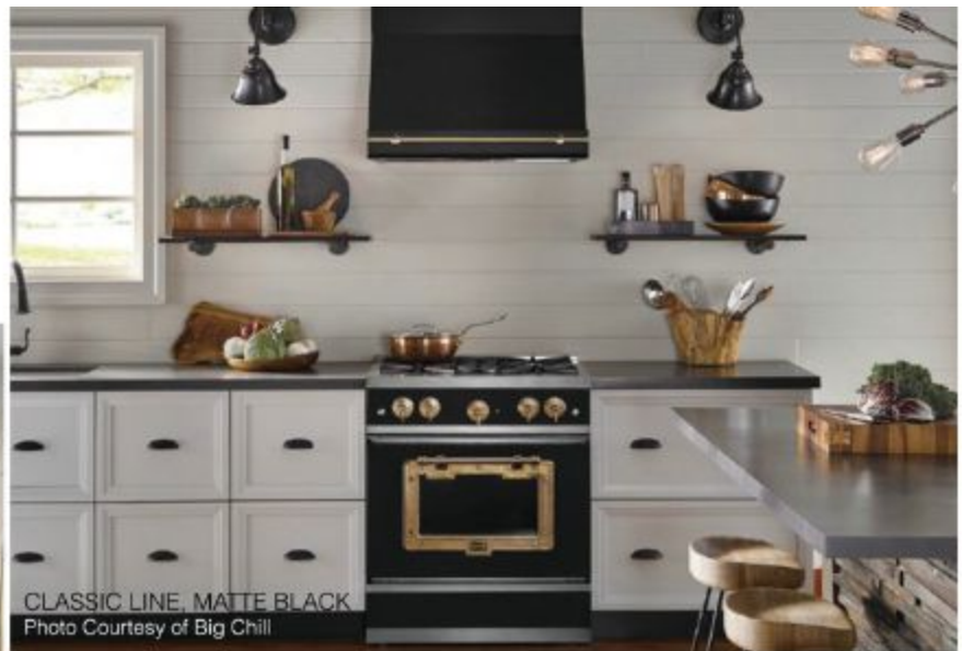
CLASSIC LINE, MATTE BLACK

Kitchen appliances are adding in color. "Big Chill has a classic series we love. They have a matte black refrigerator, stove and hood with mixed metals thrown in. We're seeing gold or honey bronze used more. Faucets and fixtures are also coming out with black options: matte black, black steel or black nickel."