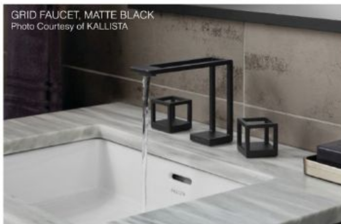
GRID FAUCET, MATTE BLACK

Open geometric shapes are popular. Vendors are coming out with a lot of fixtures and integrated lights that are LED, opening up new possibilities with organic shapes and ways to light a room, including temperature and color. "Natural textures like wicker, bigger pendant lights and light-weight concrete are being used to create interesting lighting options."